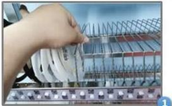
Take out the partition net to be adjusted