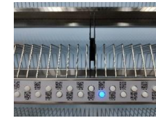
Atuo recommend the next available location