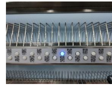
The empty position lights up, prompting to put materials