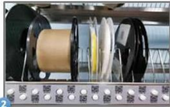
Adjust width dynamically according to material thickness