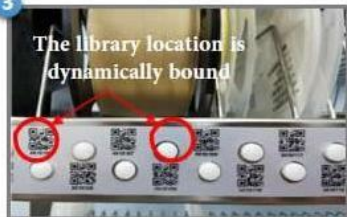
LED Indicator automatically combined display