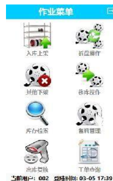
PDA scanner operation interface