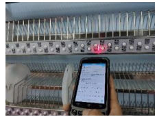
Scan code for any empty location